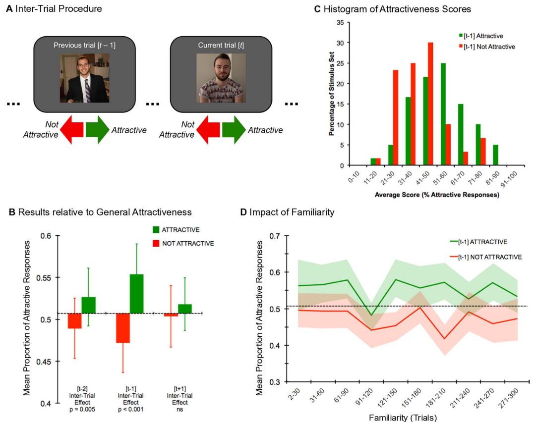
Figure 1. (A) General procedure (arrows and labels are for illustrative purposes only and were not visible during the experiment). Stimuli depicted are examples of photographs taken of men who consented to have their images reproduced for scientific communication. 300 faces were briefly presented in a random sequence and participants made a binary attractiveness judgement about each one: attractive or not attractive. (B) Bar graph of main results, averaged across subjects ( N = 16 ; error bars are \pm 1 SEM). Horizontal dashed line indicates general attractiveness (mean attractiveness score for all faces averaged across all subjects). In the centre is the [t - 1] inter-trial effect, an assimilative effect whereby the attractiveness of a current face is higher when preceded by an attractive face, and lower when preceded by an unattractive face. On the left is the [t - 2] effect, showing a weaker but still significant assimilative effect ( t_{15} = 3.27 , p < 0.005 , paired two-tail t-test). As a means of control, we calculated the [t + 1] effect. As predicted, this produced a null result as the attractiveness of an unseen future face, whether attractive or unattractive, should not alter the attractiveness of the currently viewed face ( t_{15} = 1.48 , p = 0.16 , paired two-tail t-test). (C) The distribution of responses (% of trials where the response was 'attractive') across the stimulus set ( N = 60 ) as a function of previous-trial attractiveness. Green bars reflect the distribution of scores when the preceding trial presented an attractive stimulus (with an average score greater than a subject's grand mean); red bars reflect the distribution of scores when the preceding trials presented an unattractive stimulus (with an average score less than a subject's grand mean). (D) Time course of the [t - 1] inter-trial effect plotted over 10 intervals of 30 trials showing the effect of the preceding face's attractiveness on the current trial was consistent across the entire trial block. The dashed horizontal line indicates general attractiveness as in panel (B).

is strongly biased by the face seen immediately prior. In short, if the face you just saw was attractive, you are more likely to judge the current one as attractive, and vice versa.