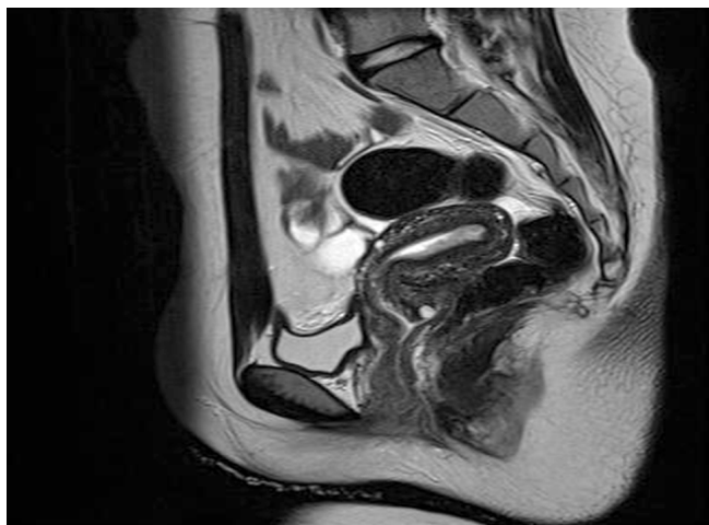
Fig. 1. Magnetic resonance imaging showing nodular mass involving the fundus and diffuse superficial infiltration along the entire posterior wall.

Under the diagnosis of stage IA, grade II endometrial adenocarcinoma, megestrol acetate (megestrol acetate suspension; Daewon Pharmaceuticals, Seoul, Korea) was administered with a dose of 160 mg daily for 3 months. A follow-up endometrial biopsy after the medication showed asynchronous endometrium with multifocal degenerated atypical glands (Fig. 2C). Treatment was continued with medroxyprogesterone acetate (Provera, Pfizer Pharmaceuticals, New York, NY, USA) with a maintenance dose of 10 mg daily