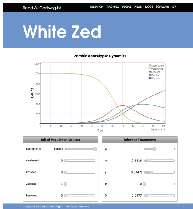
FIGURE 2. Screenshot of the White Zed simulation website. The graph displays population dynamics of a zombie apocalypse. The left control panel allows users to specify the population makeup at the beginning of the simulation, while the right control panel allows users to specify the infection parameters of the disease.

In order to facilitate the translation of our experiences using zombie epidemics to teach infectious diseases, we have developed White Zed, a web-based application available at http://cartwrig.ht/apps/whitezed/ (Fig. 2). White Zed is designed to allow for interactive exploration of mathematical models of disease, and is a starting point for introducing zombie epidemics into classwork. At its core, White Zed contains a modified SVEIR differential-equation model, integrated using the Runge-Kutta method (19). Students use