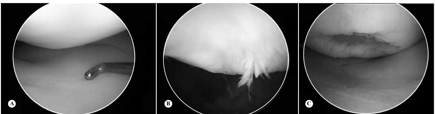
Figure 2 – Showing at letter A, cartilage without lesion; B, grade III chondral lesion; C, grade IV osteochondral lesion.