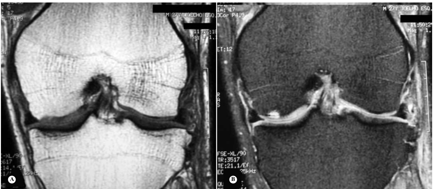
Figure 1 - NMR with T1 weighting (A) and T2 weighting (B) on the patient of the radiographs in photo 1 (B and C), showing appearance of chondral lesion that was not seen on the radiographs. The lesion is seen better with T2 weighting.

Non-reparative and non-restorative surgical techniques such as debridement and radiofrequency methods can be used. These have the aim of promoting