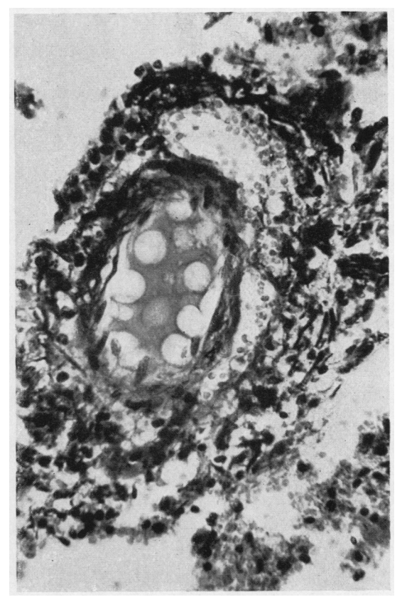
FIG. 2.—The hyphae electively develop around the vessels and display a tendency to invade their walls. Haematoxylin-cosin stain. × 200.

Owing to the tentative diagnosis of cerebral tumour the specimen for microscopic examination had been fixed in formol. Thus, inoculations on culture media were impracticable and the fungus could not be