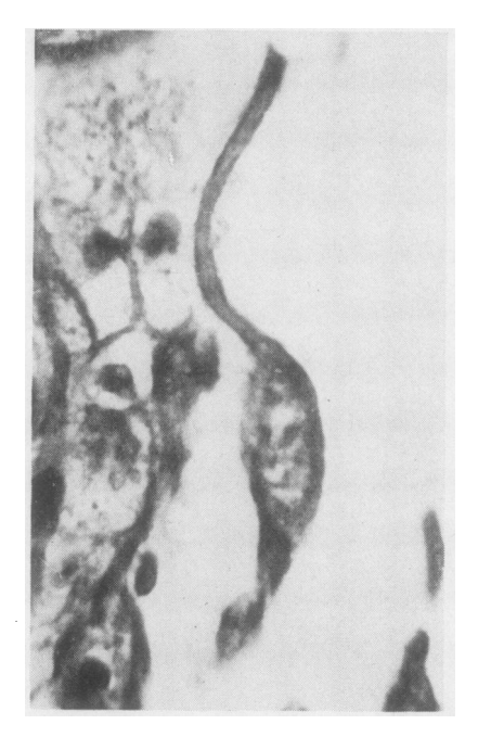
FIG. 3.-A hypha with an oval ending containing sporulated structures (sporangium). Haematoxylin-cosin stain. \times 400 .

subsequent cystic softening. The fungus continued to develop around the cystic cavity.