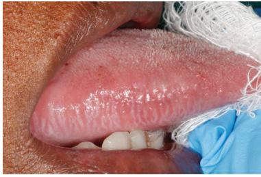
FIGURE 1: Mild oral hairy leukoplakia of the lateral border of the right side of tongue in a 44-year-old HIV-seropositive female. The lesion was asymptomatic and microscopic examination of an incisional biopsy showed hyperkeratosis, mild acanthosis, and a mild, chronic inflammatory infiltrate. Special stains showed the presence of Epstein-Barr virus.

reason treatment is to be undertaken, acyclovir, cryotherapy, laser treatment, surgical excision, or application of topical retinoids may ameliorate the lesion, but recurrence is not uncommon [4, 9–11].