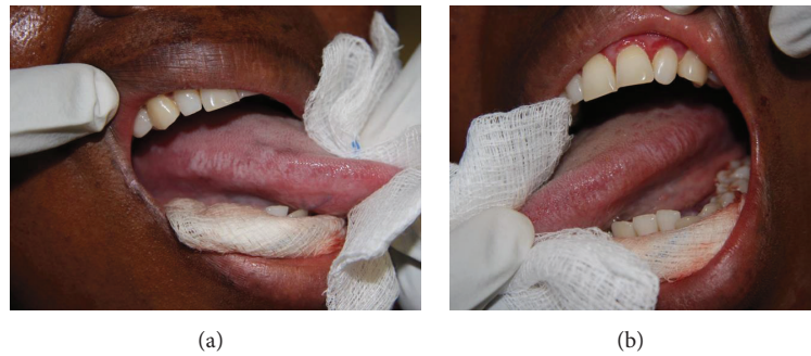
FIGURE 2: Mild oral hairy leukoplakia of the left and right lateral borders of the tongue in a 38-year-old HIV-seropositive female with a CD4+ T-cell count of 15 cells/mm 3 . The lesions were asymptomatic. The patient also had oral Kaposi sarcoma that was subsequently successfully treated with systemic cytotoxic chemotherapy.