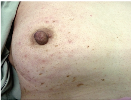
FIGURE 2: Right breast after second-line chemotherapy.

peritoneal metastases at the lower abdomen and perihepatic region, including some ascites and multiple enlarged intra-abdominal lymph nodes with necrotic appearance, ranging 0.6–1.1 cm in size. Retreatment was initiated and progressed through several regimens. With appropriate support in palliative care, the patient passed away 10 months later because of cancer dissemination.