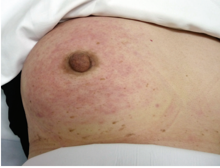
FIGURE 1: Right breast revealed red, swollen skin and peau d'orange sign.