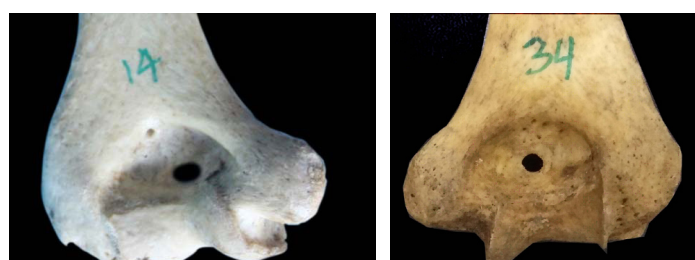
[Table/Fig-4]: Oval supratrochlear foramen. [Table/Fig-5]: Round supratrochlear foramen.

In the oval STF [Table/Fig-4], the mean transverse and vertical diameters on the left was 4.9 and 3.27 mm and on the right it was 5.12 and 3.48 mm respectively. The mean diameter of the round foramen [Table/Fig-5] was 3.23 and 4.89 mm for left and right sides respectively. In the triangular type [Table/Fig-6], the mean transverse and vertical lengths were 4.6 and 3.92 mm respectively on the left and 5.58 and 4.30 mm respectively on the right. There was only one sample of the rectangular STF [Table/Fig-7] which was right sided. Its length was 4.1mm and the breadth was 2.27 mm. The reniform type [Table/Fig-8] totalled 7, of which 6 were on the left