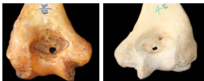
[Table/Fig-6]: Triangular supratrochlear foramen. [Table/Fig-7]: Rectangular supratrochlear foramen.

In the oval STF [Table/Fig-4], the mean transverse and vertical diameters on the left was 4.9 and 3.27 mm and on the right it was 5.12 and 3.48 mm respectively. The mean diameter of the round foramen [Table/Fig-5] was 3.23 and 4.89 mm for left and right sides respectively. In the triangular type [Table/Fig-6], the mean transverse and vertical lengths were 4.6 and 3.92 mm respectively on the left and 5.58 and 4.30 mm respectively on the right. There was only one sample of the rectangular STF [Table/Fig-7] which was right sided. Its length was 4.1mm and the breadth was 2.27 mm. The reniform type [Table/Fig-8] totalled 7, of which 6 were on the left