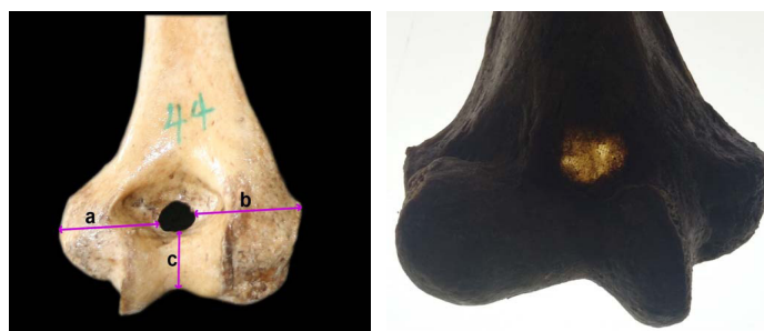
[Table/Fig-11]: Diagram showing key points of measurements. (a: tip of medial epicondyle to STF margin, b: tip of lateral epicondyle to STF margin, c: Lower margin of trochlea to STF margin) [Table/Fig-12]: Translucent septum.

side. The average vertical length at the hilar point was 4.52 mm and the average transverse measurement was 7.44 mm on the left. The lone right sided reniform STF was smaller with a vertical length of 3.83mm and 6.2 transversely. The present study reports 8.3% sieve STF [Table/Fig-9], that is 5 out of the total 60 obtained. The foramina of the right side were found to be larger, regardless of shape. The mean values of the distance from the medial epicondyle, lateral epicondyle and trochlea to the STF margins were tabulated separately for right and left sides [Table/Fig-10, 11]. Of the 244 humeri inspected in the present study, 139 (56.8%) showed translucency [Table/Fig-12]. The prevalence of translucent septum on the left and right side were 69 and 70 respectively.