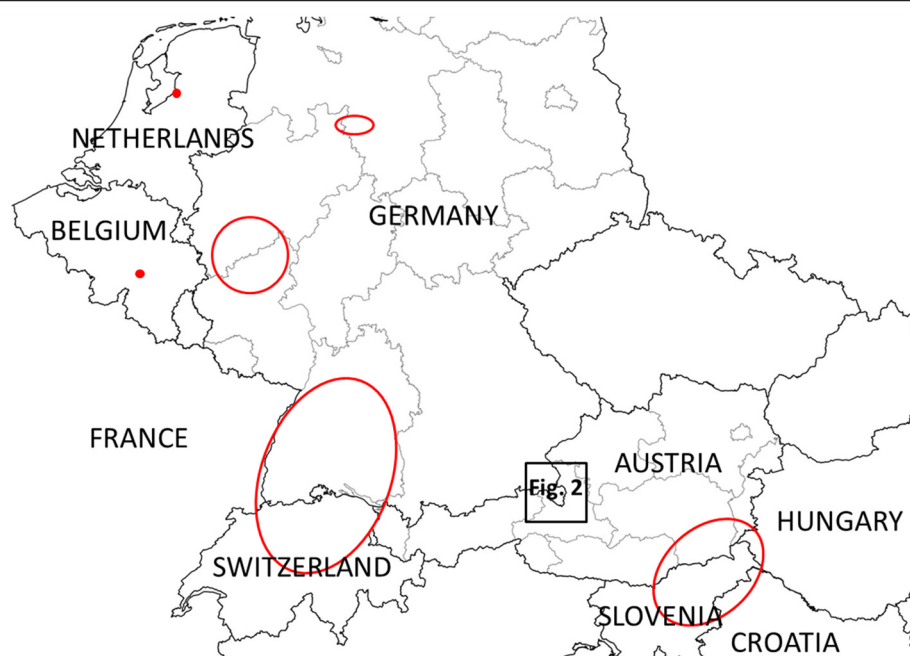
Fig. 1 Geographical location of previously detected Ae. j. japonicus populations in Europe (red dots and circles) and of the newly discovered population (Fig. 2 inset)

On the occasion of a visit to Upper Bavaria (inset in Fig. 1) in August 2015, water containers on the premises