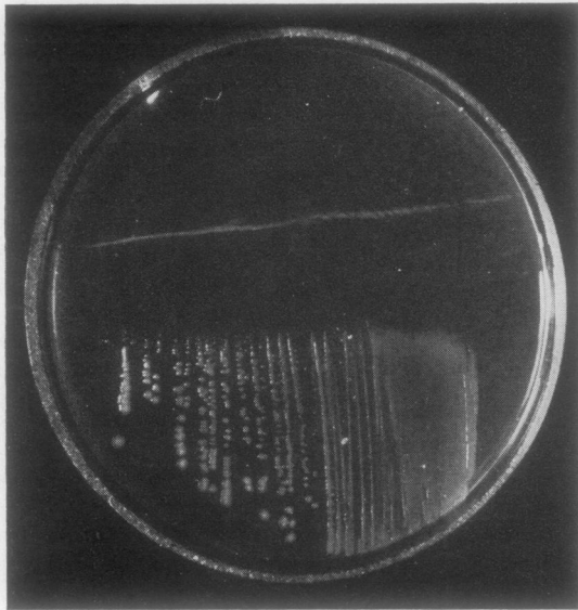
FIG. 1. S. typhi sensitive to chloramphenicol.