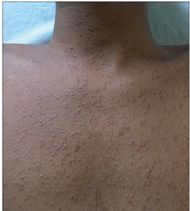
Figure 2: Multiple papules on the neck and upper chest