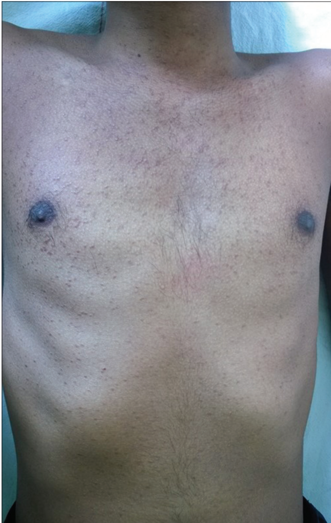
Figure 1: Multiple skin-colored follicular and nonfollicular papules

A 23-year-old man presented with mildly pruritic, small erythematous papules mainly on the face, neck, and trunk. The lesions first appeared on the forehead five years back and progressed to involve other areas of the body. There was no history of prolonged drug intake and family history was noncontributory. On examination, multiple skin-colored to erythematous nonfollicular and follicular papules were seen on the face, neck, and trunk regions [Figures 1-3]. The differential diagnoses of eruptive syringoma, acneiform eruption, and sebaceous hyperplasia were considered. Skin biopsy was done from a lesion on the upper chest. Histopathologic examination revealed mature sweat ducts lined by two layers of cuboidal cells and few having an epithelial elongation of the ducts, the