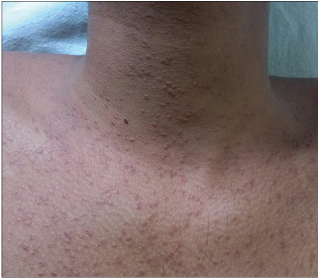
Figure 3: Close-up view of the erythematous papules