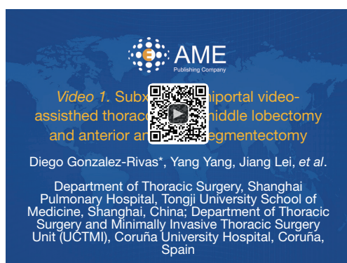
Figure 2 Subxiphoid uniportal video-assisted thoracoscopic middle lobectomy and anterior anatomic segmentectomy (10).

Available online: http://www.asvide.com/articles/904