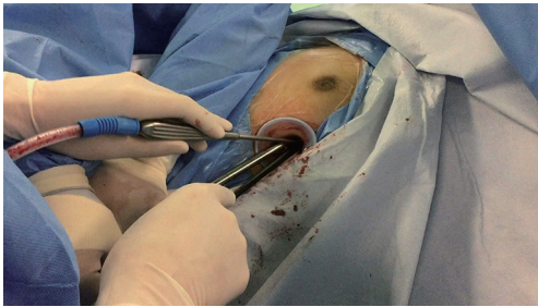
Figure 3 Surgical photo showing bimanual instrumentation through the subxiphoid incision.