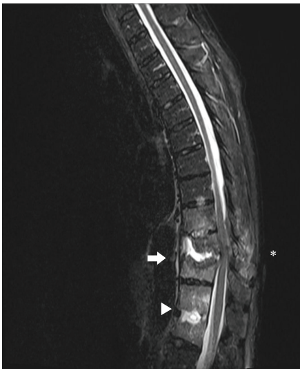
FIGURE 2: MRI of the thoracic and lumbar spine revealed spondylodiscitis in the thoracolumbar spine, worst at the T10-T11 level (white arrow) where there is associated paravertebral and epidural components with compression of the spinal cord. There is also oedema seen in the spinous processes of T9-T10 and the adjacent paravertebral muscles (Asterisk). Spondylodiscitis was also seen at T12/L1 level (white arrowhead).