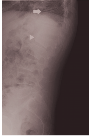
FIGURE 1: Plain radiograph of the lumbar spine revealed severe osteoarthritic changes of the thoracic and lumbar spine. There were compression collapse of T10/T11 vertebrae with mild retrolisthesis (white arrow) and a grade-one-to-two compression collapse of L1 vertebra with minimal retrolisthesis (white arrowhead).