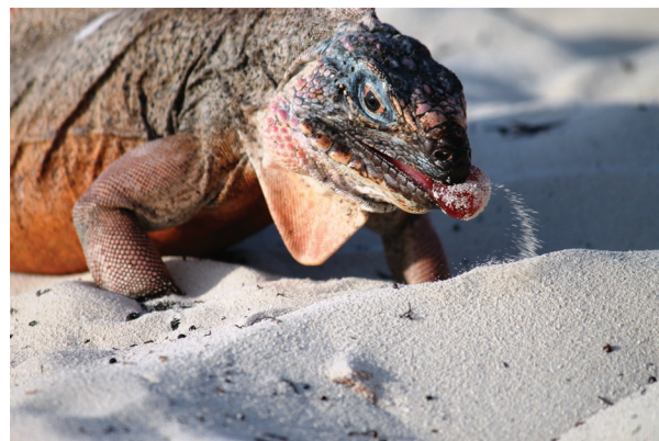
Figure 1. Allen Cays rock iguana from Leaf Cay, Bahamas ingesting a grape fed by a tourist.

We acknowledge that any physiological response between populations could be either a direct result of visitation and feeding by tourists or an indirect consequence of alterations of nutritional status, increased density, and/or altered social dynamics. We formulated hypotheses based on previous studies