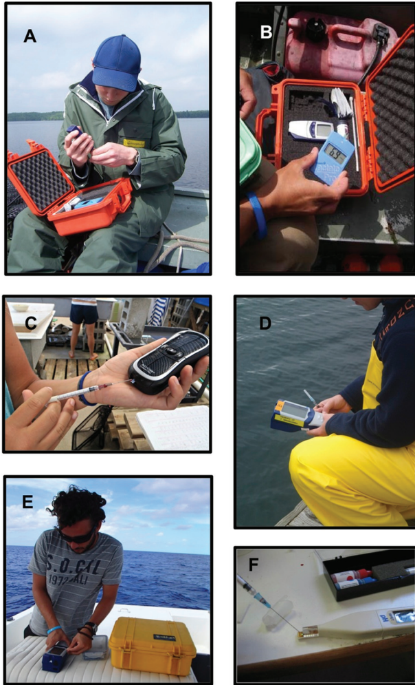
Figure 2: Point-of-care (POC) devices can be used in the field in a variety of situations. (A) Point-of-care glucose meter being set up on a boat (photograph by Lisa Thompson). (B) Protective cases, similar to the one shown, are useful for ensuring that POC devices are not damaged by the elements (photograph by Lisa Thompson). (C) Point-of-care devices, such as this glucose meter, can be used in laboratory trials to obtain immediate results on the condition of the individual (photograph by Petra Szekeres). (D) Some POC devices, such as the i-STAT, can obtain multiple blood parameters to be measured from one sample (photograph by John Mandelman). (E) Point-of-care i-STAT device in use on a boat (photograph by John Mandelman). (F) Point-of-care pH meter in use to examine blood pH in freshwater turtles (photograph by Sarah Larocque).

In addition to technological advancements of POC devices, there is an increased need for validation studies on non-human and non-domesticated species to confirm the accuracy and reliability of these devices, particularly given the lack of universality in the calibrations of POC devices among species evaluated to date. Therefore, precise calibration and species-specific validation of POC devices are necessary prior to application in a broader range of species (Lieske et al. , 2002; DiMaggio et al. , 2010; Gallagher et al. , 2010). Validation