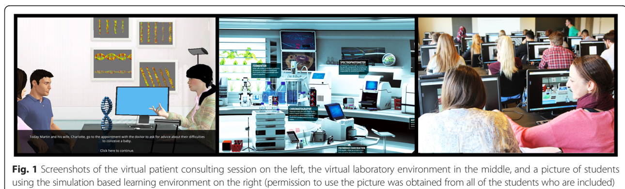
Fig. 1 Screenshots of the virtual patient consulting session on the left, the virtual laboratory environment in the middle, and a picture of students using the simulation based learning environment on the right (permission to use the picture was obtained from all of the students who are included)

The sample comprised an entire class of 300 first-year undergraduate students (60 % female; 2 did not report gender) with either a major in medicine (84 %) or molecular biomedicine (16 %) from the University of Copenhagen in Denmark in the fall 2014 semester. Data were collected during the Medical Genetics course. Prior to undertaking the learning simulation, all students had completed a traditional 1-h lecture on subjects relevant to the simulation. All students completed the simulation evaluation and knowledge questions because these were a mandatory part of the curriculum; however, only 54 and 40 % of the sample had complete and valid responses to the self-efficacy and intrinsic motivation scales, respectively, as these were optional and included within a larger survey. An analysis of the difference