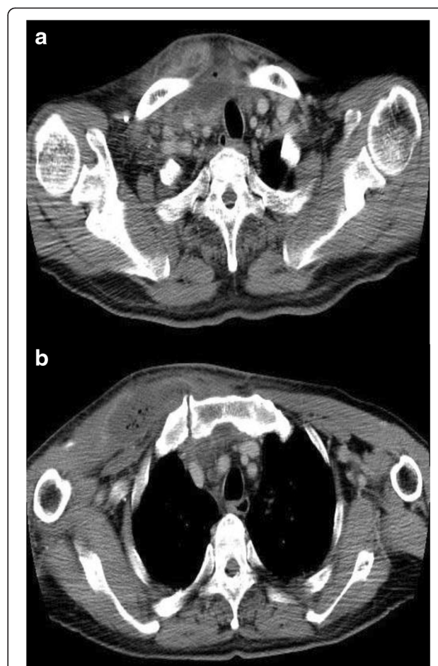
Fig. 2 Computed tomographic scans of the chest on admission. Computed tomography of the chest detected an abscess with air located below the thyroid gland and involving the right pectoral major muscle around the right sternoclavicular joint ( a , b ), as well as disaggregation of the right sternoclavicular joint ( b )

performed for wound granulation. After methicillin-susceptible S. aureus was identified in blood and wound cultures, broad-spectrum intravenous antimicrobial therapy was switched to intravenous cefazolin, which was continued for 6 weeks to treat osteomyelitis.