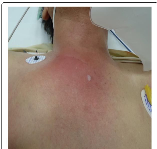
Fig. 1 Chest findings on admission. Redness and swelling of skin localizing to the sternoclavicular joint are shown

Emergency surgical debridement was performed. The skin incision began at the right border of the thyroid and extended to the head of the right clavicle. Operative findings included necrosis of parts of the right pectoralis major and minor muscles and the right SCJ. The patient also had right SCJ destruction. The necrotic pectoralis major and minor muscles and parts of the clavicle and manubrium near the SCJ that had become detached were debrided. The cavity was irrigated and packed open (Fig. 3). An initial Gram stain revealed gram-positive cocci. Ampicillin/sulbactam, which was given preoperatively, was changed to cefazolin (6 g/day), gentamicin (320 mg/day), and clindamycin (2700 mg/day) after surgery. On hospital day 6, methicillin-susceptible Staphylococcus aureus was cultured from blood and wound specimens. Antibacterial therapy was tapered to intravenous cefazolin and continued for 6 weeks to treat osteomyelitis (Fig. 4). On