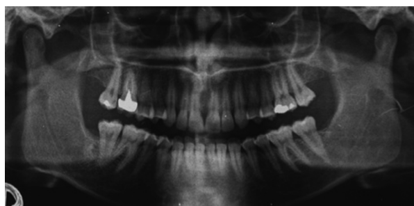
Fig. 3. Five years orthopantomographic follow-up. The second molar seems slightly aligned.