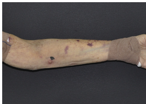
Fig 1. Cutaneous nocardiosis from N takedensis infection. Clinical image of the left upper extremity shows skin-colored to red papules in a lymphangitic distribution (black arrowhead corresponds to site of skin biopsy).