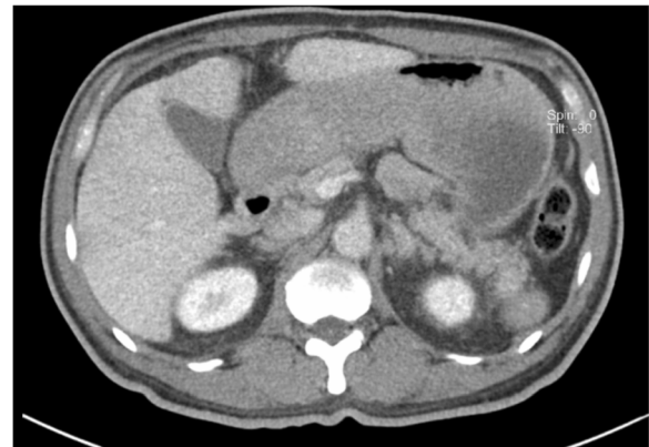
Fig. 2 Abdominal computed tomography showing distended stomach with large amounts of gastric content in spite of 4 hours of fasting prior to the scan

significant residual gastric barium at 20 hours (Fig. 3). Our patient was started on the pro-kinetic agent domperidone with little improvement in symptoms.