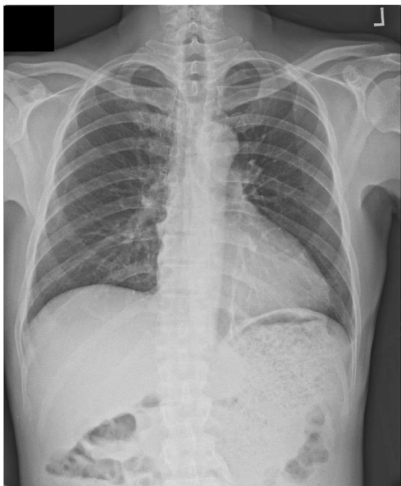
Fig. 1 Chest X-ray showing distended gastric outline with food residue

A chest X-ray showed an enlarged gastric shadow with evidence of food residue (Fig. 1). A computed tomography scan of his abdomen showed that his stomach was distended with a large amount of gastric content in spite of 4 hours of fasting prior to the scan (Fig. 2). An initial gastroscopy showed reflux oesophagitis and food retention but no evidence of gastric outlet obstruction from ulcers, masses, or strictures. A small bowel series confirmed evidence of delayed gastric emptying with