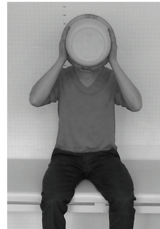
FIGURE 1: Testing the subjective visual vertical with the adapted bucket method.

2.2. Subjective Visual Vertical. SVV was assessed as described elsewhere [6] with the following changes: the iPhone application Visual Vertical [7] was applied. An iPhone was fixed to the bottom of a bucket. The application shows a red line on the screen for 15 seconds. For assessment of SVV, the bucket was randomly rotated left or right and handed over to the patient, who was then asked to align the red line on the screen into the supposedly vertical position within 15 seconds. The SVV angle is detected by the angle meter of the iPhone and shown on the screen after the test period. This test was performed three times per patient in a seated position (Figure 1), and mean deviation of absolute SVV values was calculated. Patients were assessed under regular dopaminergic treatment and, in case of response fluctuations, during the on-state. The cut-off value for SVV deviation from normal was set at 0 \pm 2.5^\circ , according to published values in healthy controls [8].