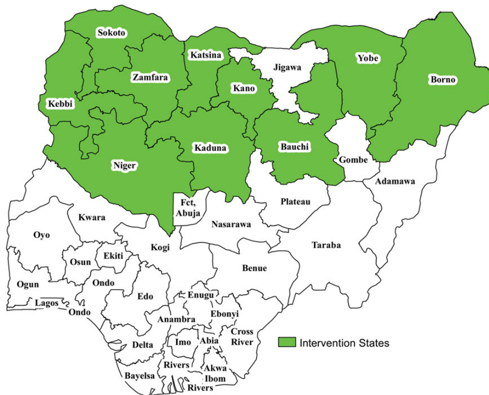
Figure 1. Geographical location of states for demand creation interventions—Northern Nigeria, 2013–2014.

In all, 7 137 460 children were vaccinated through demand creation interventions from November 2013 to November 2014.