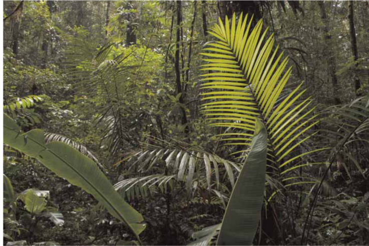
Figure 2. Typical forest understory at the Pararé site with Astrocaryum paramaca palms.