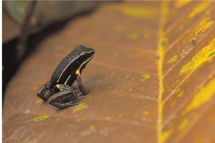
Figure 3. The Brilliant-Thighed Poison Frog Allobates femoralis (Dendrobatidae).