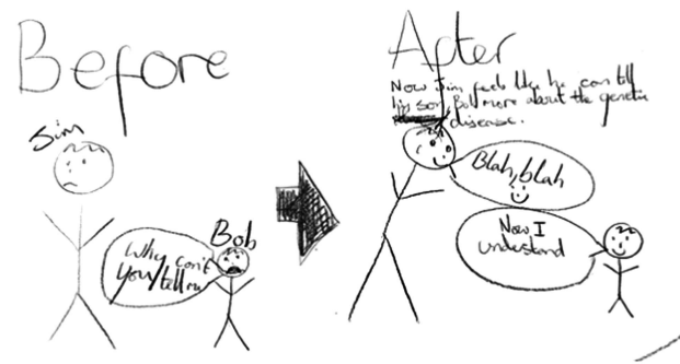
Figure 2 A picture showing a family before and after attending the MFDG intervention. In the before image the child is sad and confused asking their parent "why can't you tell me?" In the after picture the child is happier because he understands what is happening in his family because his parents have been 'able to tell his son a bit more about the genetic disease'.

Logistical challenges such as travel costs and/or child care costs were also seen as a barrier for some families' participation. The most prevalent barrier to attending the MFDG however were parents' anxieties surrounding children's exposure to other IGCs. Parents