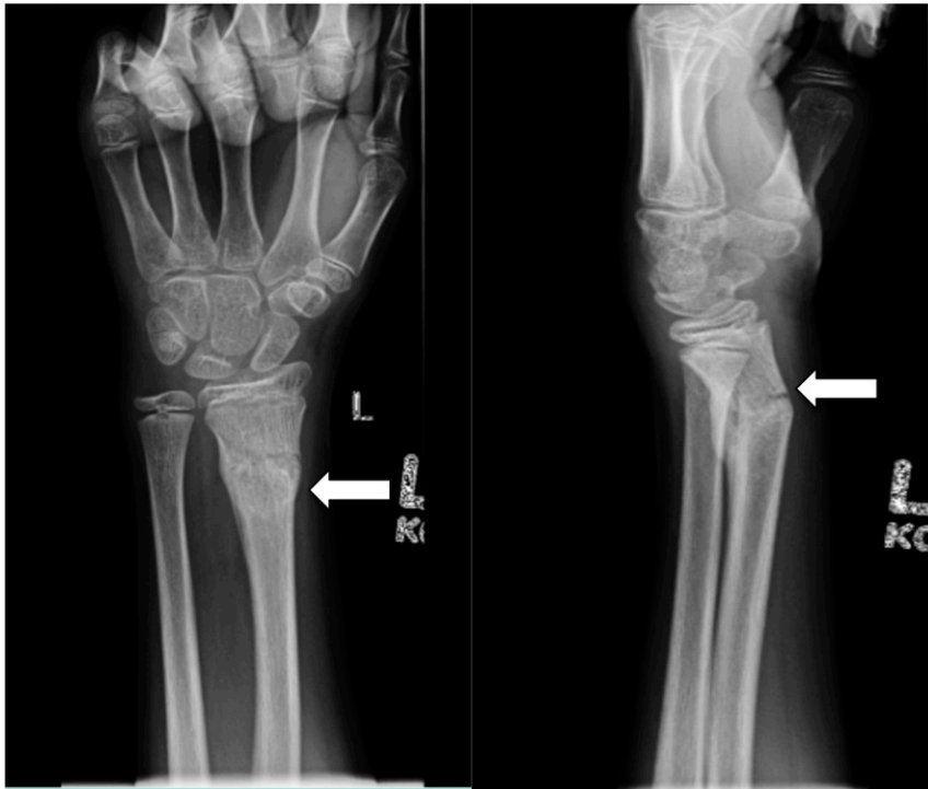
FIGURE 1 Wrist radiograph, anteroposterior and lateral views. Note the transverse fracture through the distal left radial diaphysis with callus formation (white arrow).

hypermobility, or fractures. His father was diagnosed with Graves' disease at age 30. His diet history included 3 cups of milk daily, with additional milkshakes, yogurt, and cheese. Review of systems was significant for poor weight gain over the past several months.