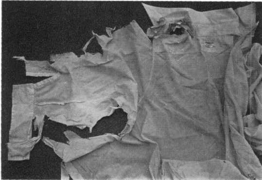
Fig. 1 Shirt from case 1.

The atmospheric conditions that give rise to lightning are now well known. 3-5 Lightning may cause current to flow by direct strike, side flash, or step voltage, depending on local circumstances. Side flash occurs when a direct strike hits a conductor of high resistance and represents a pathway of lower resistance. The step voltage effect is caused by a potential difference being set up between the feet. 4 The mechanisms by which injuries are produced include (a) electrical burns; (b) interference with the electrical status of neuro-