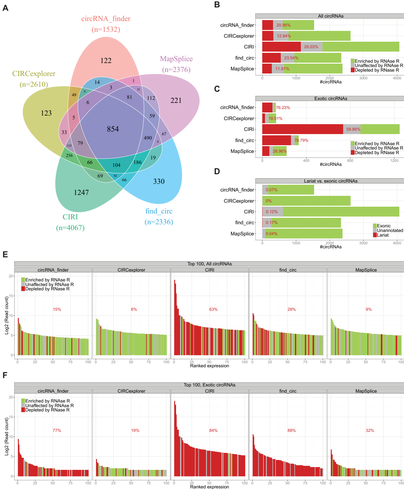
Figure 1. Prediction of circRNAs by five different prediction algorithms. (A) Venn diagram depicting the overlap between the five different circRNA prediction algorithms. (B and C) Stacked barplot of RNase R resistance of the all predicted circRNAs (B) or exotic circRNA (C, only found by one algorithm) divided into RNase R resistant (green), Unaffected (grey) and RNase R sensitive (red), as denoted. Percentage reflects the fraction of RNase R sensitive circRNAs. (D) Stacked barplot of circRNA annotation divided into exonic (green), unannotated (grey), or lariat (red). (E and F) Ranked plot of the top 100 expressed circRNAs (E) or top 100 exotic circRNAs (F) predicted by each algorithm color-coded as in B. Percentage reflects the fraction of RNase R sensitive circRNAs (false positives) within the plotted top 100.