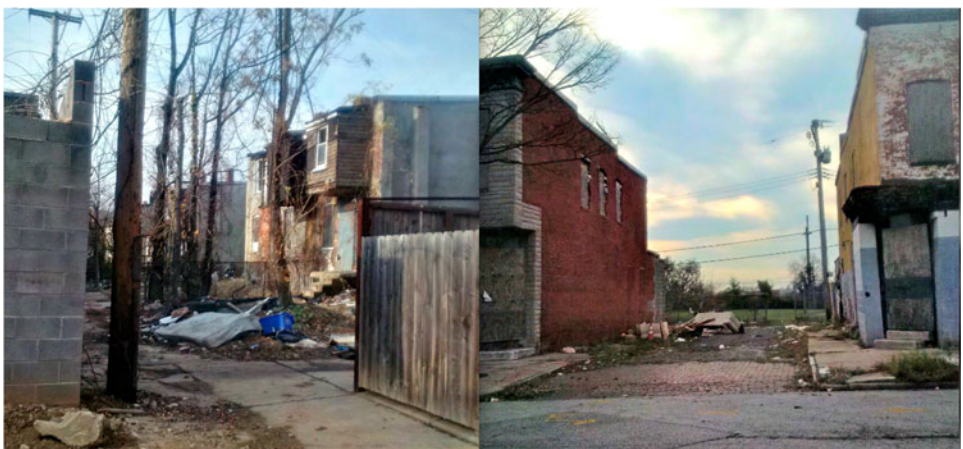
FIG. 3 Images of piled trash in Sandtown-Winchester and Clifton/Berea.

When I was brought up, if I didn't go to church I couldn't go outside. 8 PM be on