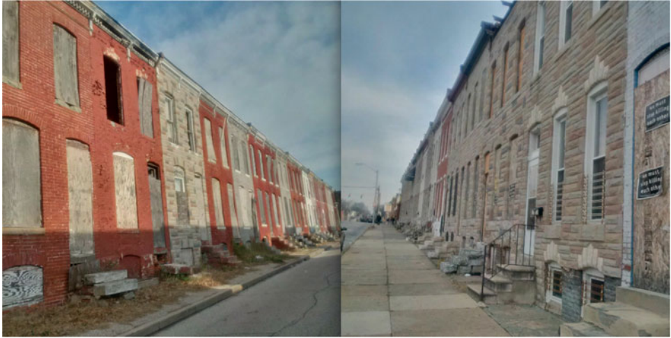
FIG. 2 Images of boarded neighborhood in Sandtown-Winchester and Clifton/Berea.

fragmented. Many had isolated themselves as a way to manage the difficulties. One noted