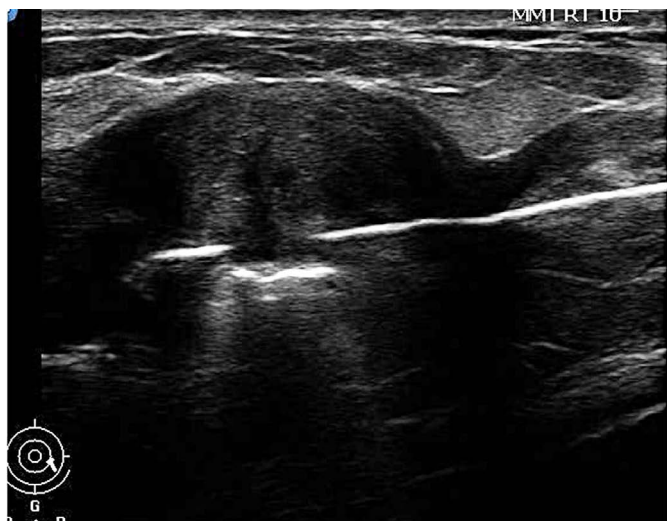
Fig. 2. A 28-year-old woman with puerperal abscess 8 weeks after delivery. Breast sonogram shows 6×4 cm hypoechoic collection within the left lower outer quadrant and inserted vacuum-assisted biopsy needle.

The abscess size ranged from 2 to 9 cm (mean, 4.2 cm). On average, the diagnosis of abscess was made 12.5 weeks following delivery (range, 8 to 21 weeks). The pus cultures from the breast abscesses showed Staphylococcus organisms in 24 patients (14 aureus , six coagulase-negative, and four multi-drug-resistant), beta-hemolytic Streptococcus in three patients and Pseudomonas aeruginosa in two patients. All patients were treated with antibiotics.