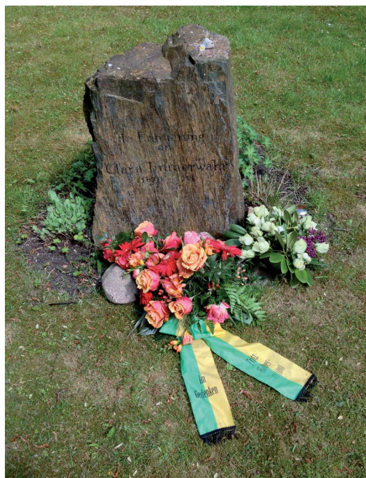
Figure 10. Memorial for Clara Haber in the garden of the Fritz Haber Institute of the Max Planck Society, installed in 2006. The photo shows the memorial at the centenary of Clara’s suicide, on May 2, 2015.

Our intention has been to make the above points without belittling in the least Clara’s achievements and courage. Honoring Clara, for instance through the Clara Immerwahr Award of the Nobel-Prize winning organization International Physicians for the Prevention of Nuclear War (IPPNW) or the Clara Immerwahr Award of the Berlin Excellence Cluster UniCat, is highly to the point and should not be questioned in any way. Haber’s institute, named after its founding director in 1952 and incorporated into the Max Planck Society in 1953, had a memorial built for Clara in the garden of the institute in 2006 (Figure 10).