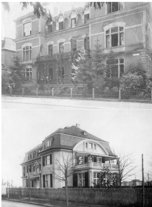
Figure 6. Upper panel: The first apartment (on the belle etage) of the Habers, at Moltkestrasse 31 in Karlsruhe. Lower panel: Directorial mansion of the Kaiser Wilhelm Institute for Physical Chemistry and Electrochemistry in Berlin-Dahlem, the residence of the Habers since 1912. Design by the chief imperial architect Ernst von Ihne.

beginning, the young family could not afford service staff and so Clara had to do a lot by herself. In a letter to Abegg written in 1901 from Karlsruhe, [31] Clara declared that she would get back to the laboratory: