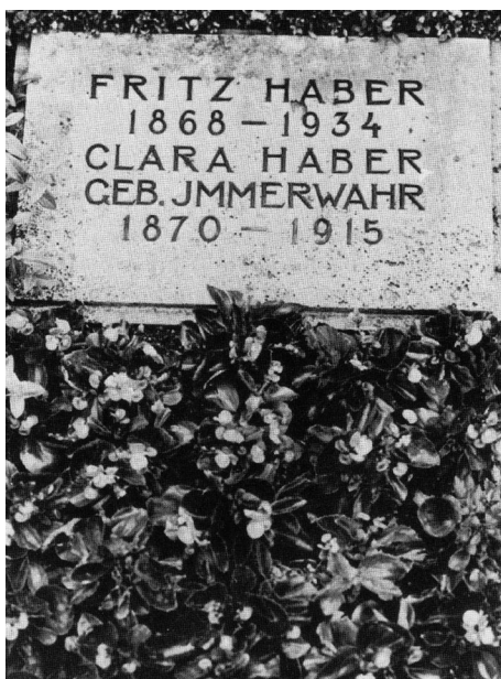
Figure 7. Gravestone of Fritz and Clara Haber at the Hörnli Cemetery in Basel.