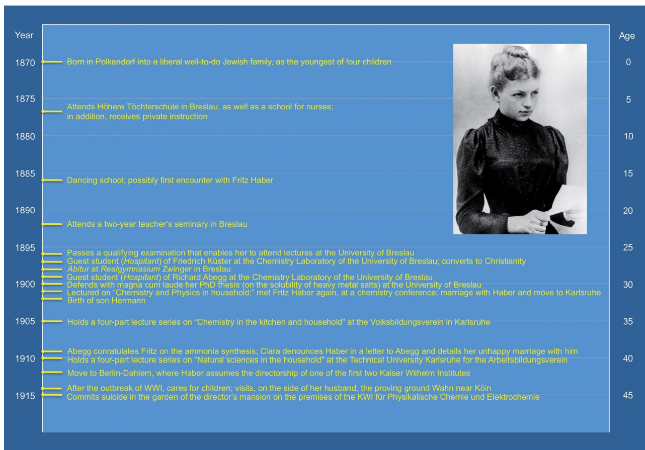
Figure 1. Timeline of Clara Haber's life.

because of need but out of principle. So despite the family's wealth, Clara and her siblings were brought up in modesty. [2]