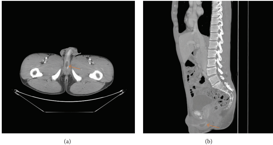
FIGURE 1: Representative (a) axial and (b) sagittal computed tomography images of the pelvis with contrast demonstrating Cowper's syringocele (arrows).