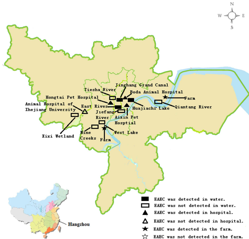
Figure 1. Distribution of sampling locations and sites where EAEC were recovered in Hangzhou, China. The figure was generated by obtaining the map of Hanzhou city from Zhejiang Administration of Surveying Mapping and Geoinformation (ZheS(2010)280) with the agency's permission and further refined by Adobe Photoshop CS2 software.

bacterial infection, which is also commonly seen in hospitals in China 13–15 . Clinical EAEC isolates producing CTX-M-type extended spectrum \beta -lactamases (ESBLs) have been reported in Korea 16 and Spain 17 . However, little data on the prevalence and genetic characteristics of EAEC isolates in China is available. In this study, we performed comparative characterization on both human clinical and environmental EAEC isolates to identify the possible origin of EAEC strains that commonly cause infections in China, and characterized the molecular basis of virulence and antimicrobial resistance in such organisms.