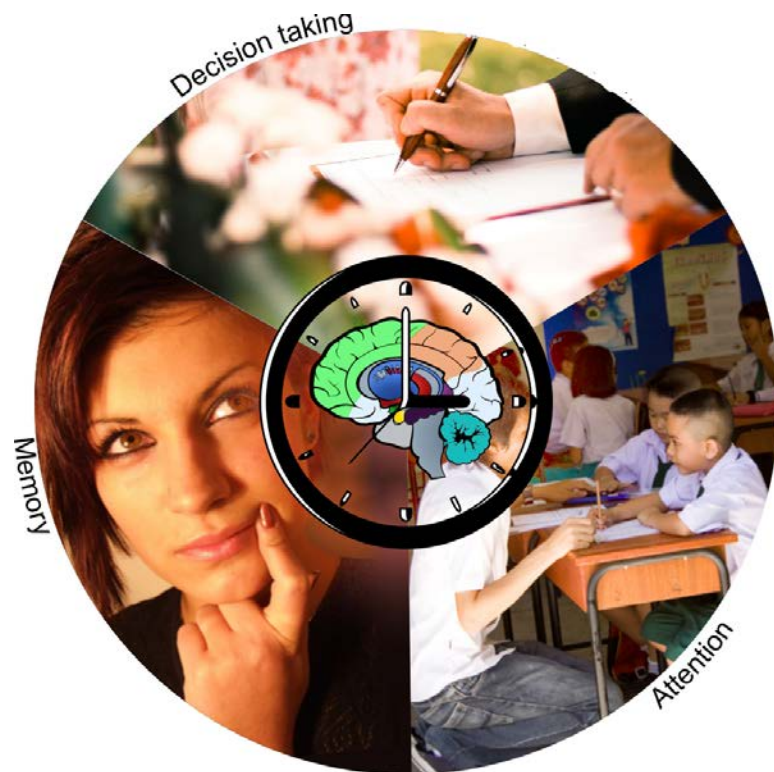
Figure 1. The central nervous system has a critical role in high hierarchy timing process and executive functions such as memory, decision-making and attention. 2

that are considered to represent specialized timing. 23 Independent of the models, human beings estimate and distort time. 24 Thereby, time notion is dependent on intrinsic (emotional state) and extrinsic context (sensitive