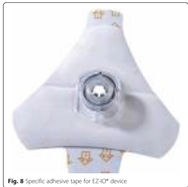
Fig. 8 Specific adhesive tape for EZ-IO® device

Besides the inability to insert the needle or a subsequent displacement, complications of IO insertion are uncommon, lower than 1 % of insertions. Compartment syndrome due to extravasation of fluid is the most common complication. If the needle has been inserted without