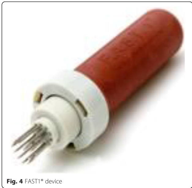
Fig. 4 FAST1® device