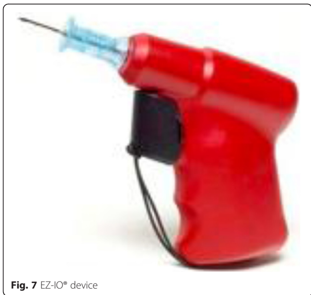
Fig. 7 EZ-IO® device

Despite a large amount of literature on the subject, there is no clear recommendation for one device over another in a given situation. In fact, comparative studies were conducted on cadaver models [18], very far from a real emergency scene, where stress is a confounding variable of performance. Furthermore, studies on patients are rarely prospective and include only a small number of patients. In one recent randomized controlled trial study comparing different devices in 107 adults, the success rate on first attempt was higher (92 % vs 83 %,