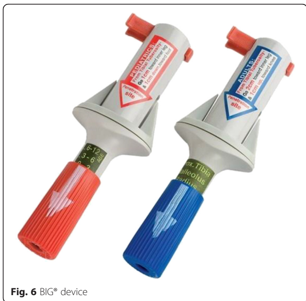
Fig. 6 BIG® device

in the bone. When the needle is inserted with EZ-IO®, the operator drills the needle with the power driver into the bone perpendicular to the insertion site.