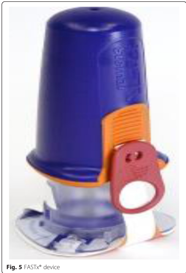
Fig. 5 FASTx® device