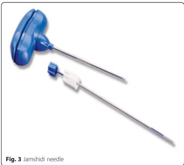
Fig. 3 Jamshidi needle

When a physician practices the manual IO access procedure, he/she has to ensure a safety guard on the needle of 1 cm with thumb-index and realize an axial twisting motion to insert the needle in the bone. If the needle is inserted with the FAST®, the insertion site is located just below the sternal notch. The operator holds the introducer perpendicular to the manubrium and presses down until the needle is released. When BIG® is used, the operator holds it firmly to avoid the projection up of the needle perpendicular to the insertion site, squeezes the safety latch and pushes to eject the needle