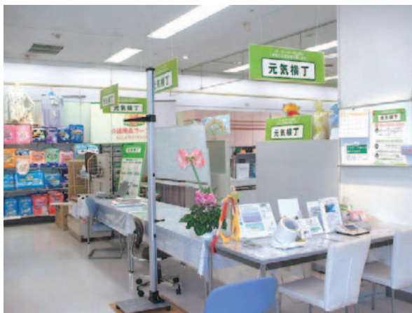
Fig. 2 Health support counter in a certain supermarket

lifestyle, and physical and psychological burdens from caregiving may increase the risk of the onset or exacerbation of lifestyle-related diseases among caregivers.