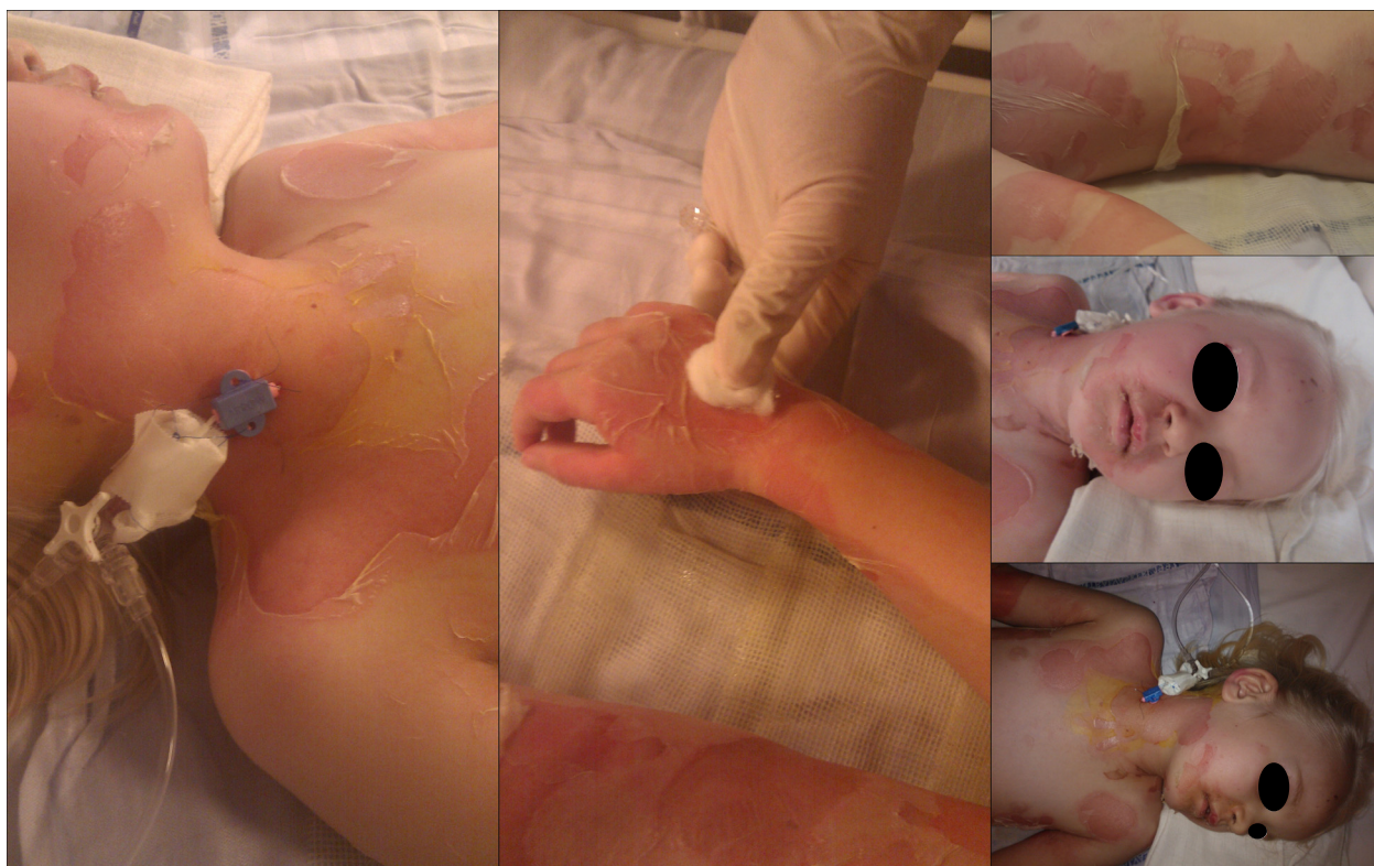
Figure 2. Pictures illustrates the progression of SSSS on the third day. Desquamation of skin covering 55% of the body's surface area.

to the full thickness denudation found in TEN and SJS. SSSS is most common in children and not a result of medication as in TEN/SJS. Although similar histopathologically to TEN, SJS needs at least two mucous membrane involvements, and unlike TEN, the skin involvement is generally limited to less than 30% body surface area. Skin biopsy can rapidly differentiate between SSSS and TEN/SJS [4].