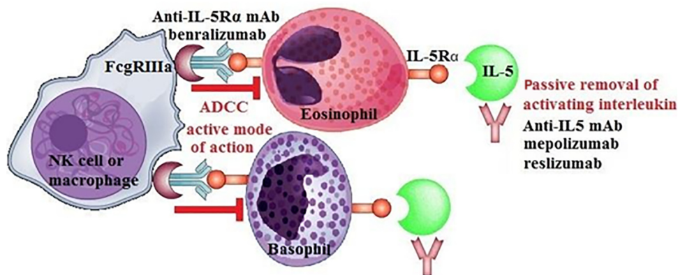
Figure 2 The mechanism of action of therapies targeting IL-5 and its receptor.

Abbreviations: IL, interleukin; ADCC, antibody-dependent cell-mediated cytotoxicity; NK, natural killer; mAb, monoclonal antibody.