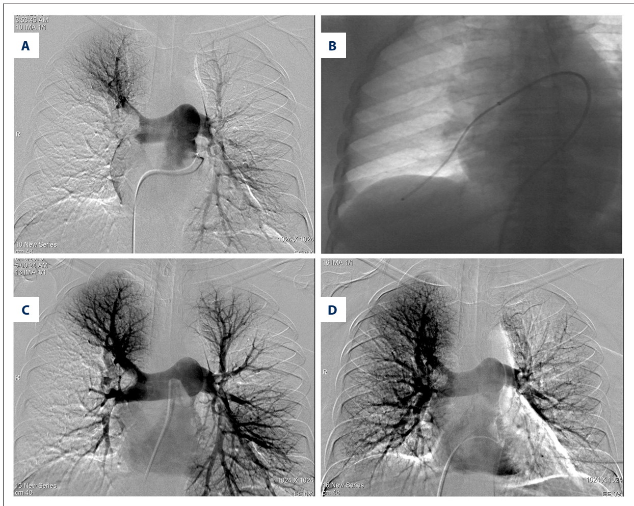
Figure 1. (A) Pulmonary angiography showing filling defect of the right main and low left lobar pulmonary arteries. (B) Thrombus aspiration was performed with a guide catheter which was inserted through a long introducer sheath. (C, D) Final angiograms after catheter aspiration and local alteplase administration.

the clot (Figure 1B). After several passes, control low-dose contrast injections were performed. If total or partial recanalization was achieved, we switched to another obstructed segment. The procedure was considered clinically successful when the subsegmental branches became visible behind recanalized pulmonary artery segments with an improvement in hemodynamic parameters without major complications (such as a perforation of the pulmonary vascular or cardiac structures, tamponade, or death) [9,14]. Pulmonary angiography was performed routinely before and 24 hours after the procedure (Figure 1C, 1D).