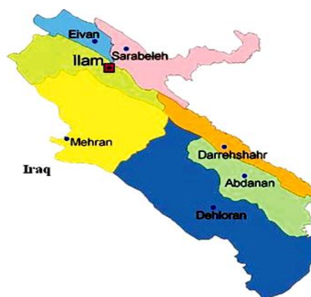
Fig. 3: Map of Ilam and its counties in 2014 from Iran Meteorological Organization (13).

(24) who both found the highest incidence in the 20-29 yr age group. By contrast, Maraghi et al. reported that in Shush, most cases appeared in patients of less than 10 years of age (25). Although the age pattern for cutaneous leishmaniasis varied, rural disease endemicity, parasite species, and host genome patterns increased in incidence in the younger age groups, which indicates high endemicity for this part of the country (26). Evidence suggests that the epidemiological focus in Mehran can be categorized as hyper endemic (Fig. 3).