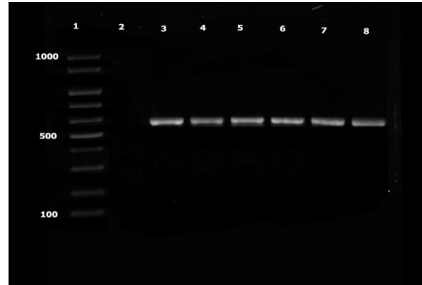
Fig. 1: Agarose gel electrophoresis of Leishmania isolates. Lane 1, DNA size marker 100 bp; lane 2, negative control; lane 3, L. major (positive control 560 bp); lanes 4, 5, 6, 7 and 8, L. major isolates obtained from skin lesions of the patients in Mehran

The Leishmania bodies of the 92 isolates were detected by microscopic observation. The samples were all tested by PCR technique. Electrophoresis of the nested PCR products and comparison of the banding patterns with those of the standard samples showed that the bands of all 92 isolates were 560 bp in length, which is standard for L. major (Fig. 1).