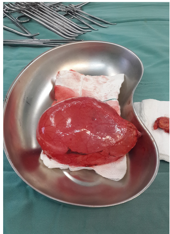
Figure 4. A completely excised huge pericardial cyst placed on the surgical sponge. Image shows an enucleated serum-filled cyst.