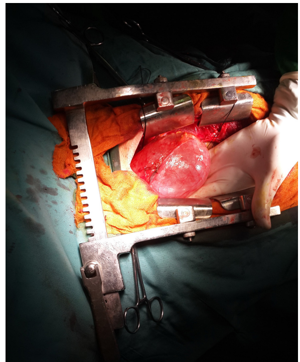
Figure 3. A thin-walled pericardial mass is seen in intra-operative photography.