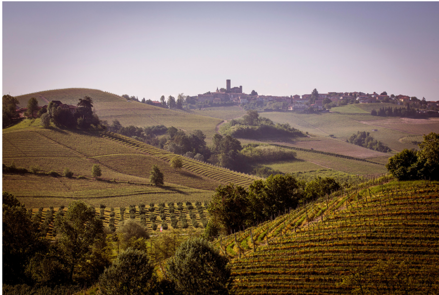
Fig. 1 Landscape of Langhe

in-depth interviews specifically addressing the mechanisms of transmission of TEK related to truffles were also conducted. Prior Informed Consent was always obtained before each interview and the Code of Ethics of the International Society of Ethnobiology was strictly followed [32]. The interviews were conducted in