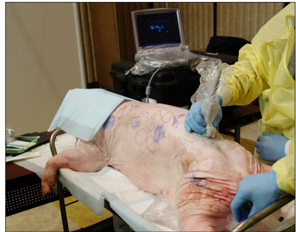
Fig. 3. A pig carcass used in an ultrasound workshop.

A meat phantom is moderately cheap compared with the Blue phantom. Since it has anatomic structures, it gives some tactile needle feedback, and the echogenicity of the background mimics human tissue. Practice of needle guid-