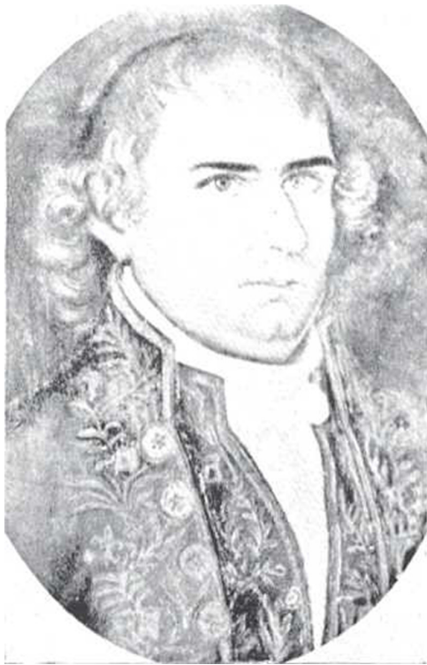
Figure 4 Narciso Esparragosa y Gallardo, who performed the first contemporaneously documented cataract extractions in Latin America in 1797.

Notes: Copyright © 1945. Editorial Universitaria. Reproduced from Duran CM. Las Ciencias Médicas en Guatemala: Origen y Evolución . 2nd ed. Guatemala: Tipografía Nacional; 1945. 38