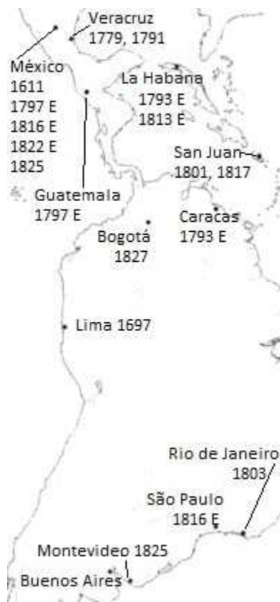
Figure 1 Evidence of cataract surgery in Latin America appears by year. Note: E denotes evidence of cataract extraction (as opposed to couching or division).

practicing in Mexico by 1611, because one had to practice for 5 years before taking the “protomedical” examination, which Drago appears to have done by 1616 (Figure 1). 8 In 1616, the viceregal government moved to expel him to Europe because he was a foreigner. Drago did not fight this effort, but the public outcry and the testimony of the “protomédico” on November 4, 1616 that “Drajo” had no equal in the kingdom moved the government to relent. 6 In 1621, because he was the city’s “only and excellent” oculist, the city decided to pay him 200 pesos annually, to defray the costs of treating the poor. He was still practicing in 1625. 9