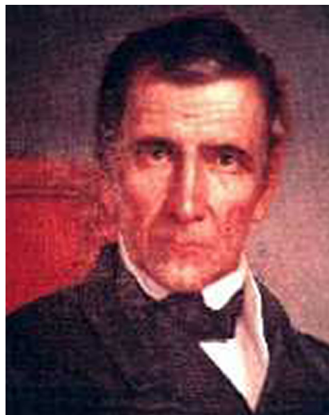
Figure 9 Portrait of José María Vargas, by Martín Tovar y Tovar.