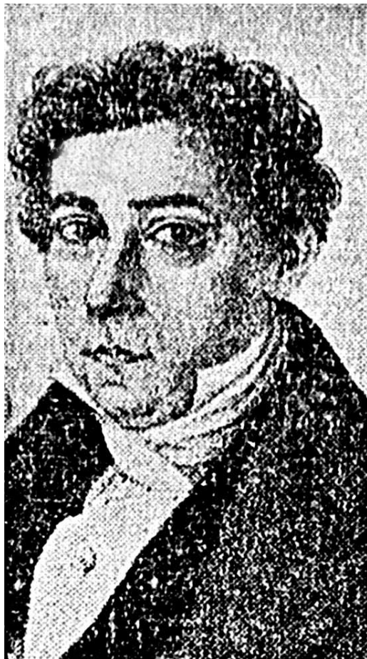
Figure 5 Portrait of Francisco Alvares Machado de Vasconcellos (1792–1846).

Cirurgía a chair for extracting cataracts (“un banquillo para extraer cataratas”). 62,63 The chair immobilized the patient, permitting the operation to be completed quickly, while keeping the patient and the surgeon comfortable. 62 By 1816, he had used the chair to operate at no charge on eight poor persons who completely recovered their vision. 9 Muñoz also invented a cataract knife and eyelid speculum (Figure 7). 60,64 Despite performing extractions, he still did couchings occasionally. 64 Muñoz’s successors viewed him as the father of ophthalmology in Mexico. 64 They knew that a Spaniard had preceded Muñoz in performing cataract surgery in Mexico, but could not remember Quiñones’ name. 64