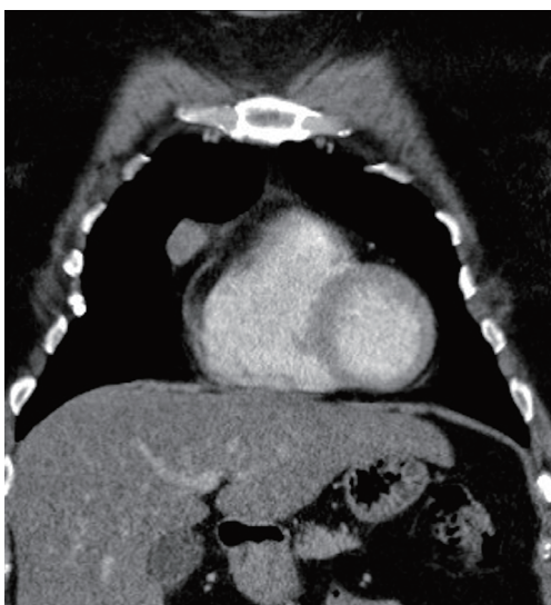
Figure 1 Contrast-enhanced computed tomography (CT) depicting a solitary well-defined mass with homogeneous enhancement adjacent to the right heart border.