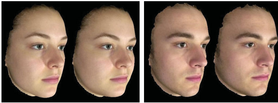
Figure 1. Female and male 3D face shapes associated with low (left of each pair) and high (right of each pair) BMI. For women, the face shapes correspond to BMIs of 18 and 31, respectively; for men, the face shapes correspond to BMIs of 17 and 29.

the relative validity of cues [14,43], these are two areas of health perception which are still largely unexplored. The expectation may be that multiple cues of health are congruent (as has been argued for cues to mate quality [53–56]).