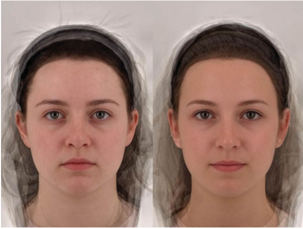
Figure 3. Composite images illustrating the difference in facial characteristics of those rated low (left image, mean rating 3.5) and high (mean rating 5.7) in perceived health.

Entering skin yellowness, mouth curvature and facial adiposity into multiple regression with perceived health as the dependent variable revealed independent contributions to perceived health from skin yellowness ( b = 0.22 , t = 2.11 , p = 0.038 ), and from upward mouth curvature ( b = 0.39 , t = 3.36 , p = 0.001 ); ( R^2 = 0.28 , overall model: F_{3,75} = 9.71 , p < 0.001 ). This regression analysis failed to reveal an independent contribution of facial adiposity ( b = -0.06 , t = -0.46 , p = 0.648 ), possibly because in this sample facial adiposity correlated with downward mouth curvature ( r_{79} = 0.53 , p < 0.001 ).