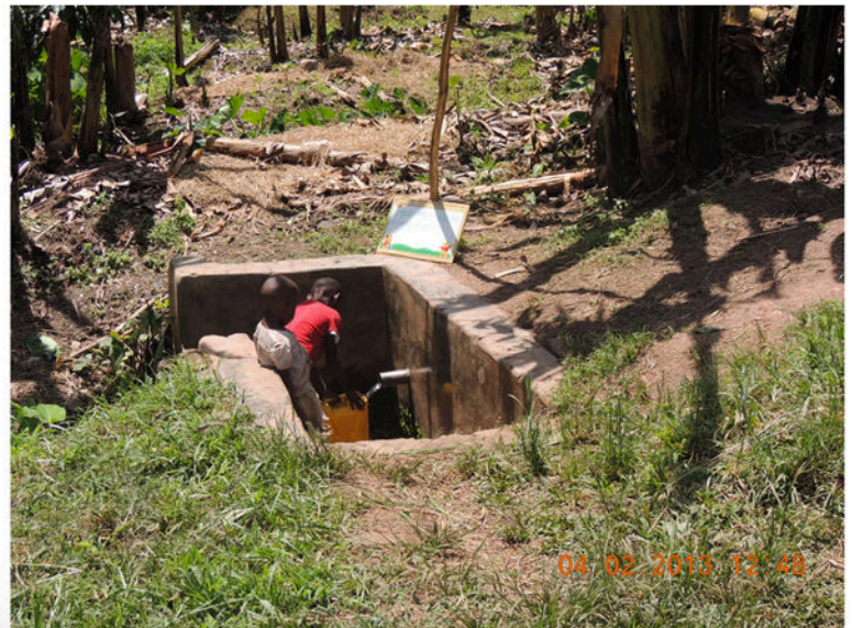
Figure 2. Sample query results (English language version) for photo-assisted identification of household water source using Computer Assisted Survey Information Collection (CASIC) Builder™ software

Water source number: 2 Cell: Nyamikanja 2 Village: Kyaritimbo Type: Spring Name: Kyaritimbo Select