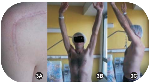
Figure 3: Clinical photograph of the incision (A), and functional outcome of the patient at 2 years follow up (B & C)

We operated 20 months after the initial injury through posterior approach. The greater tuberosity fixed with 3 cancellous screws (Fig. 2). The supraspinatus tear was repaired through the same approach using 5mm titanium anchor (Fig. 2). Post operatively the patient was managed in a sling with 60° of abduction for 6 weeks and the rehabilitation was started 4 weeks after surgery.