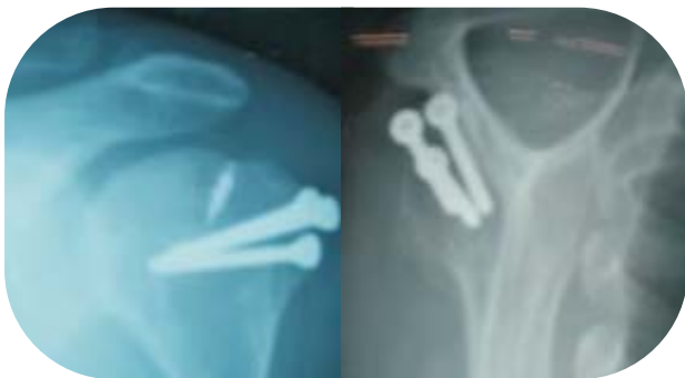
Figure 2: Radiograph of the shoulder showing fusion of the tuberosity fragment at 2 years post re-fixation.

was displaced posteriorly and superiorly (Fig. 1). The sagittal images demonstrated fatty infiltration in supraspinatus stage 2 [12,13].