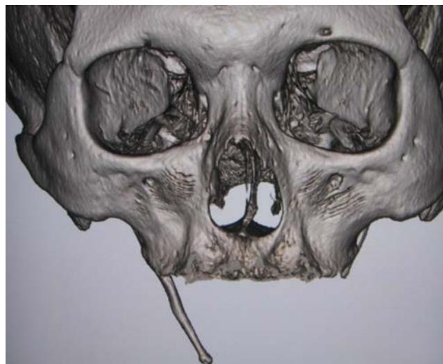
Figure 3. This image was postoperative 3D-computed tomography. His throat pain was improved by shortening the left styloid process.

tals 1,5,6,8,12,15 stated that the first choice for treatment of elongated styloid process was surgery because of the severity of symptoms. Ghosh 5 insisted that surgical shortening of the elongated process was the only to give symptomatic relief to the patient. This surgical shortening of an elongated styloid process is often performed using an intraoral or external approach. 7,15,16 It can often enable an intraoral approach requiring shorter surgical time and less surgical trauma without leaving visible scars on the neck. The external approach to the styloid process involves a transcervical approach to the parapharyngeal space, 6 and wider visualization in the operative field than