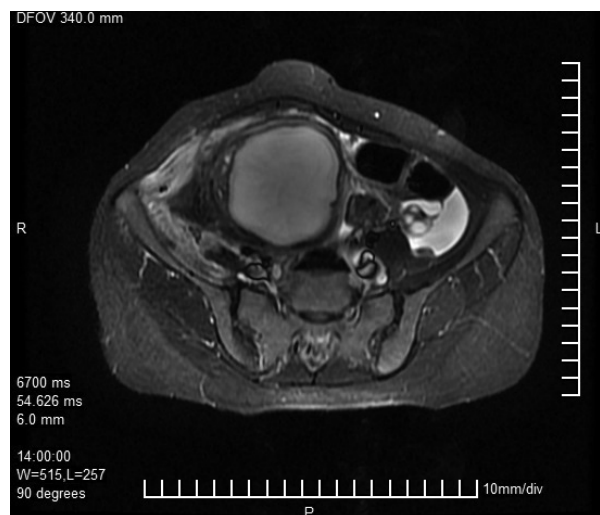
Fig.7: Axial T2W MRI image showing large hyperintense right adnexal cyst (endometriotic cyst). MRI; Magnetic resonance imaging.