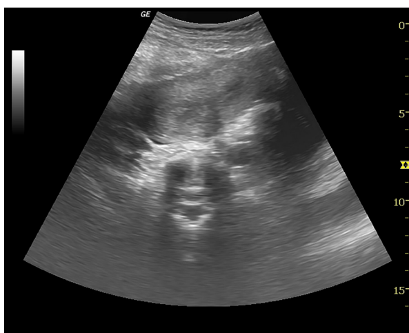
Fig.2: Transverse ultrasound image showing two uterine cavities with echogenic endometrium.

An ultrasound scan done for pelvic organs at our institute revealed uterus didelphys (Fig.2) and a cystic fluid collection with low level internal echoes arising from the pelvis consistent with associated haematocolpos (Fig.3). Cystic lesion was noted in the right adnexa consistent with endometrioma. Right kidney was not visualized (Fig.4).