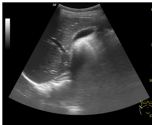
Fig.4: Transverse ultrasound of right hepatorenal space showing absent kidney in the right renal fossa.

Subsequently magnetic resonance imaging (MRI) was performed to better characterize the pelvic anatomy and better identify the anatomic location of this pelvic fluid collection. MRI revealed uterine didelphys with two separate cervixes (Fig.5). The right cervix and proximal hemi-vagina were distended that led to the comparison of the left cervix and hemi-vagina (Fig.6A). The left endometrial cavity appeared normal; however, the left cervix/hemi-vagina was constricted in its lower part due to pressure from the distended cervix and hemi-vagina on the right side resulting in partial obstruction of menstrual blood outflow, as seen in the patient (Fig.6B). The high T2 MRI signal characteristics in