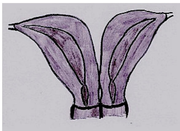
Fig.1: Class III MDAs-uterine didelphys. MDAs; Müllerian duct anomalies.

Although HWW syndrome includes variability of the anatomic structures like uterine, cervical, vaginal and/or renal anomalies, it is characterized by the presence of uterus duplicity and OHVIRA syndrome.