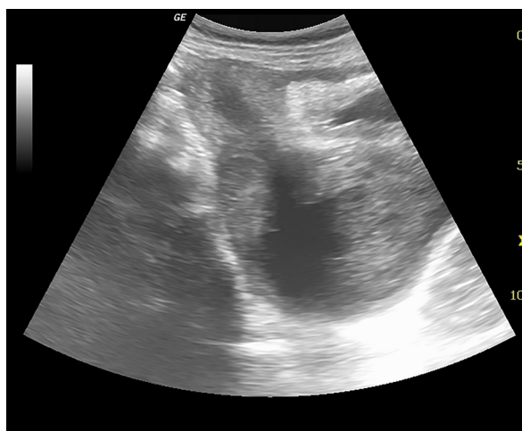
Fig.3: Longitudinal ultrasound image depicting a cystic lesion posterior to urinary bladder with low level echoes and communication with endometrial cavity through the cervix.