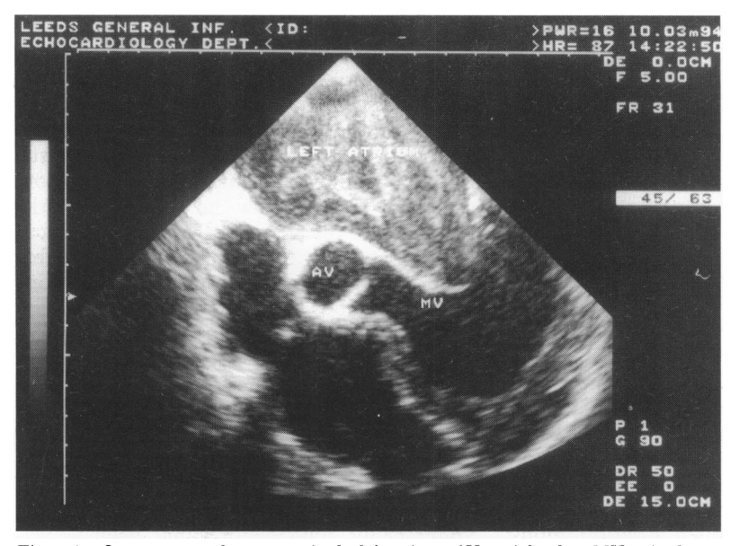
Figure 2 Spontaneous echo contrast in the left atrium. AV, atrial valve; MV, mitral valve.

model was constructed using a stepwise technique, including all variables with univariate P < 0.1. Analyses were performed using SPSS 6.1 for Windows.